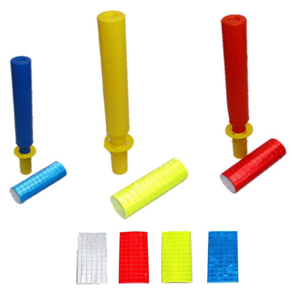
Coloured Retro Reflective Sheaths

A delineator, clearly marking the edge of the taxiways and roads. For the day and night marking of taxiways a vertical Blue Linlaner 375mm Post and 250mm Blue Retroreflective Sheath is necessary to comply with ICAO requirements.